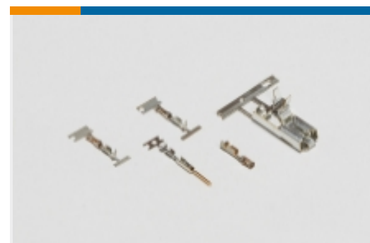
Wire-to-Board Connector Contacts(4)