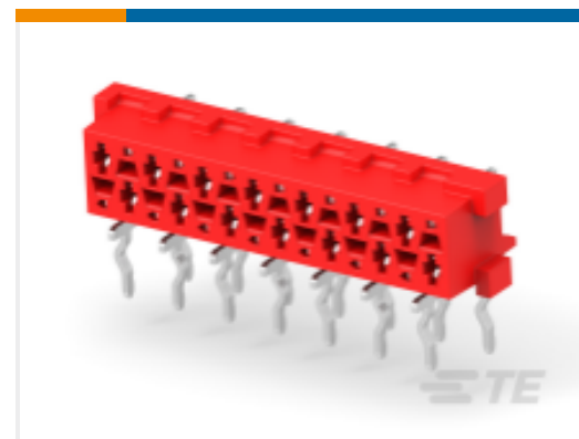
TE Part # 8-215460-4 MICR-MATCH FSID P