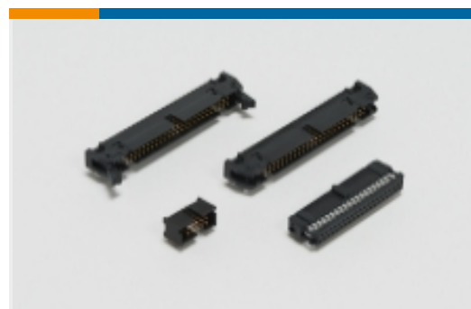
Ribbon Cable Connectors(185)