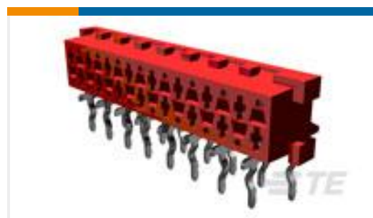
TE Part # 1-215460-4 MICRO-MATCH FEM.SE