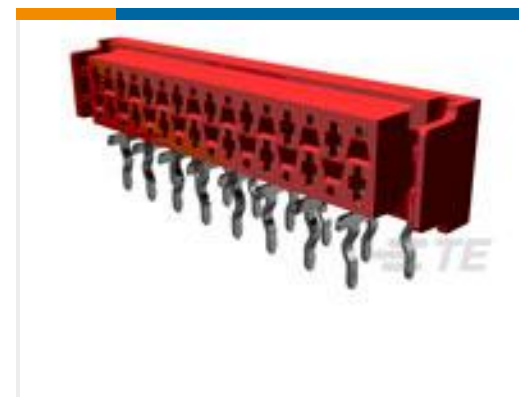
TE Part # 1-338070-4 MICRO-MATCH FEM.SE