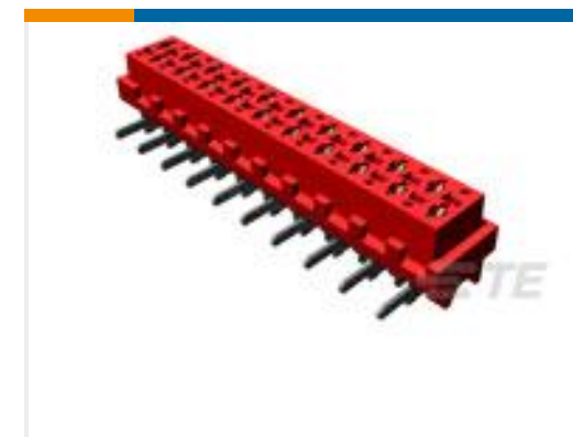
TE Part # 8-188431-4 M-MATCH FEM. BOTTOM ENTRY SMD INB.CONN.