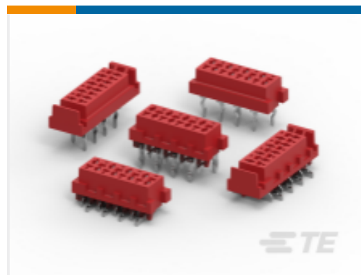
TE Part # CAT-M5833-F3492A Female-on-Board Connector, Top Entry