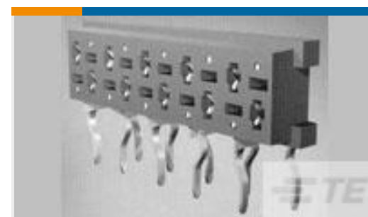
TE Part # 8-100400-4 MICRO-MATCH FSID NP