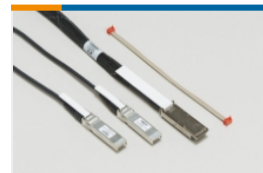
Pluggable I/O Cable Assemblies(53)