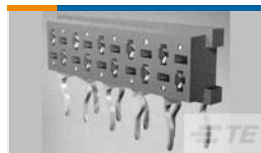
TE Part # 1-100400-4 MICRO-MATCH FSID NP