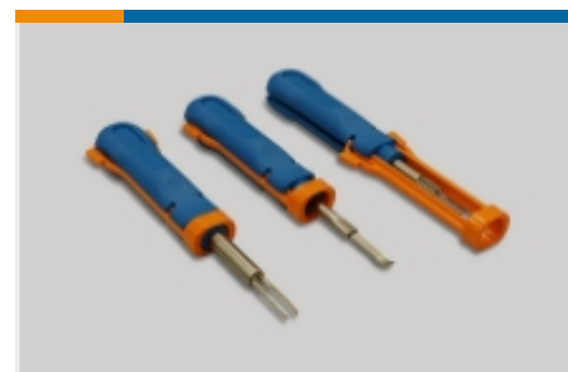
Insertion & Extraction Tools(1)