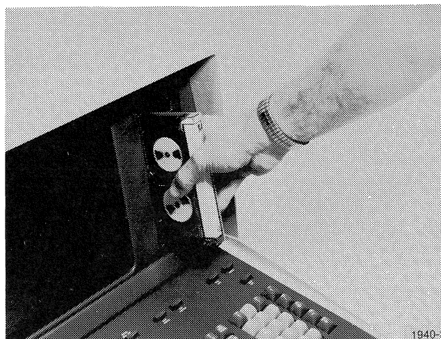
Fig. 1-3. Inserting the tape cartridge in the controller tape cartridge slot.

To remove the tape cartridge, press the EJECT button until the tape cartridge extends about one inch beyond the front panel and pull the cartridge out of the tape slot.