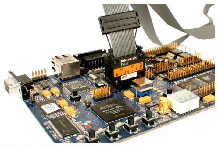
P5934 34-channel Mictor probe

For applications where circuit board space is limited, the 34-channel highdensity P5960 D-Max offers the smallest available footprint and a quick connection mechanism.