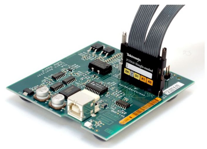
P5960 34-channel D-Max probe

For applications where circuit board space is limited, the 34-channel highdensity P5960 D-Max offers the smallest available footprint and a quick connection mechanism.