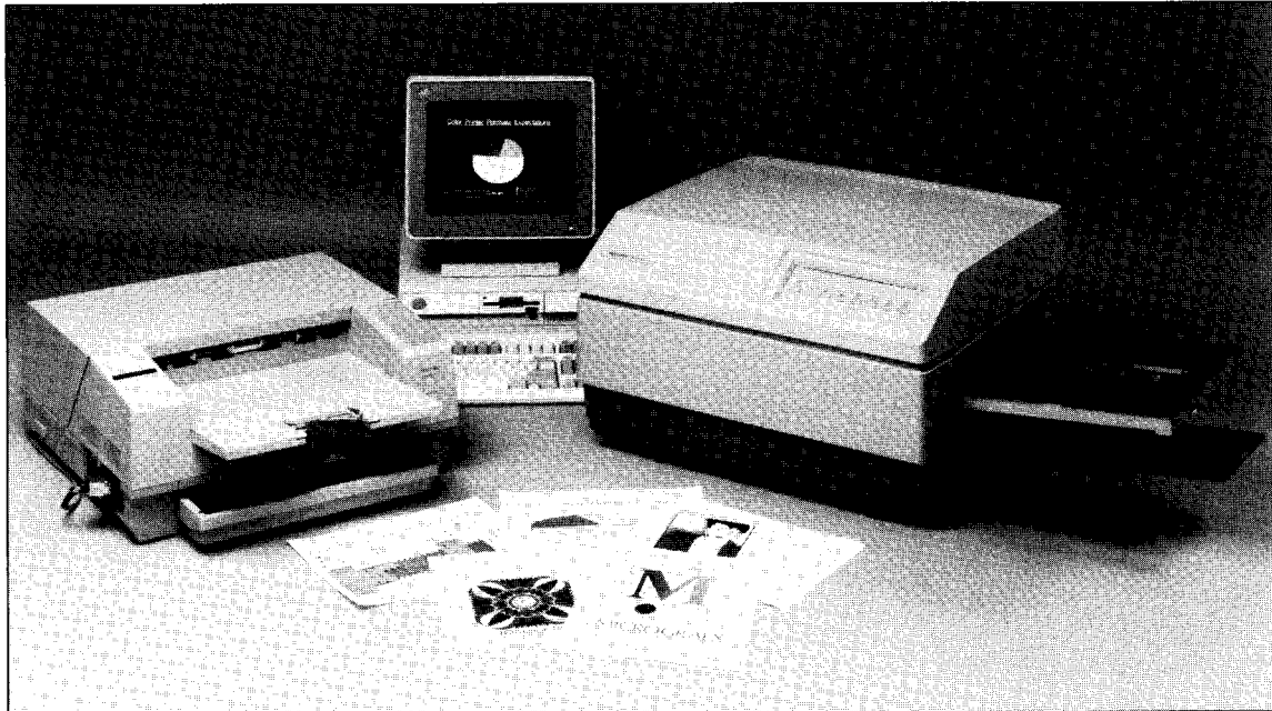
New Phaser™ Printers