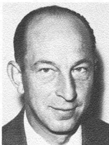
Fred Hart Customer Service Parts Publication