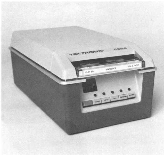
4924 DIGITAL CARTRIDGE TAPE DRIVE

The TEKTRONIX 4924 Digital Cartridge Tape Drive can act as an auxiliary storage device of the 4051 and/or with systems that employ the General Purpose Interface Bus (IEEE Standard 488-1975). The 4924 can generate Service Requests to the 4051 and transmit information about its operation to the 4051 in a Status Byte. If an error occurs in the 4924, an additional Error Byte contains information about the error.