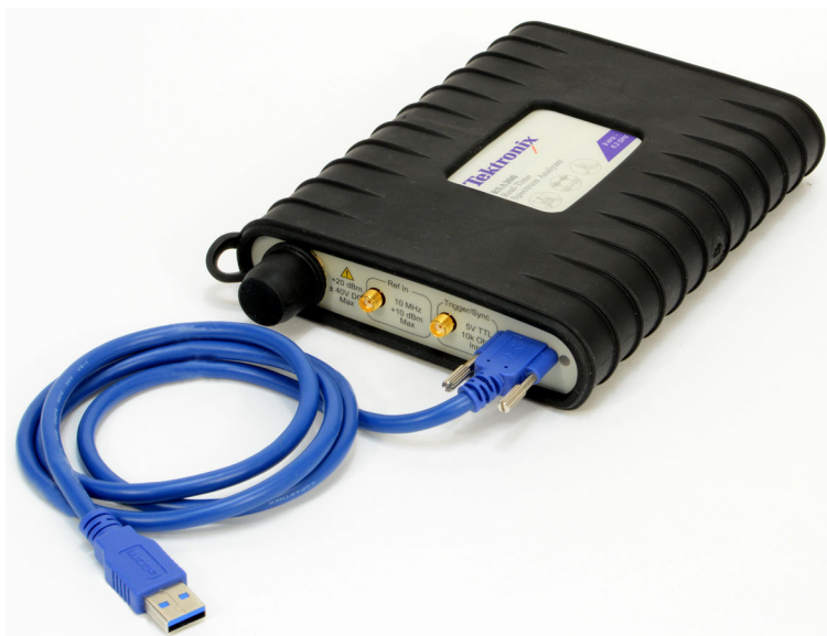
Figure 1: RSA306 Real-Time Spectrum Analyzer

The RSA306 is a portable, 40 MHz Real-Time Spectrum Analyzer that contains an acquisition system inside a small module. The user interface and display resides on a user-provided PC running SignalVu-PC software or a user-developed application. The host PC provides all power, control, and data signals over the USB 3.0 cable included with the instrument. An available SW API is provided to allow you to create your own custom signal processing application.