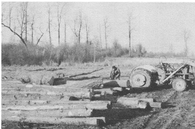
OPERATION SNAG TREE — Chris Schindler (Grounds Maintenance) operated a tractor earlier this week when "snag trees" were being stacked up where employees will have easy access to them.