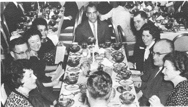
ANNUAL BROTHERHOOD BANQUET Monday evening at the Multnomah hotel was enjoyed by Tektronix employees and their spouses. Dinner was sponsored by the National Conference of Christians and Jews.

Tektronix, Inc., Beaverton, Oregon Vol. 3, No. 48 March 1, 1963